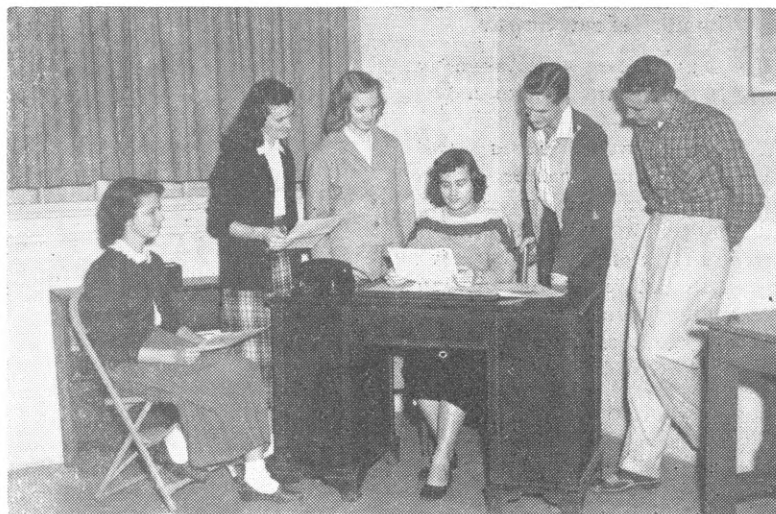
TREV-ECHOES STAFF 1954-55