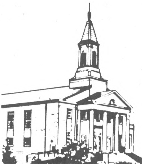
FIRST CHURCH OF THE NAZARENE