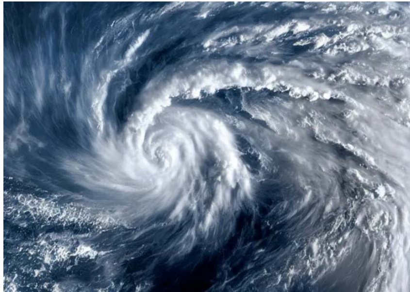
Cyclone Freddy Hits Mozambique, Madagascar, and Malawi

In February and March 2023, Severe Tropical Cyclone Freddy pummeled the African coastline for five weeks. Following this historic event, assessments of damages and impact on life were staggering: