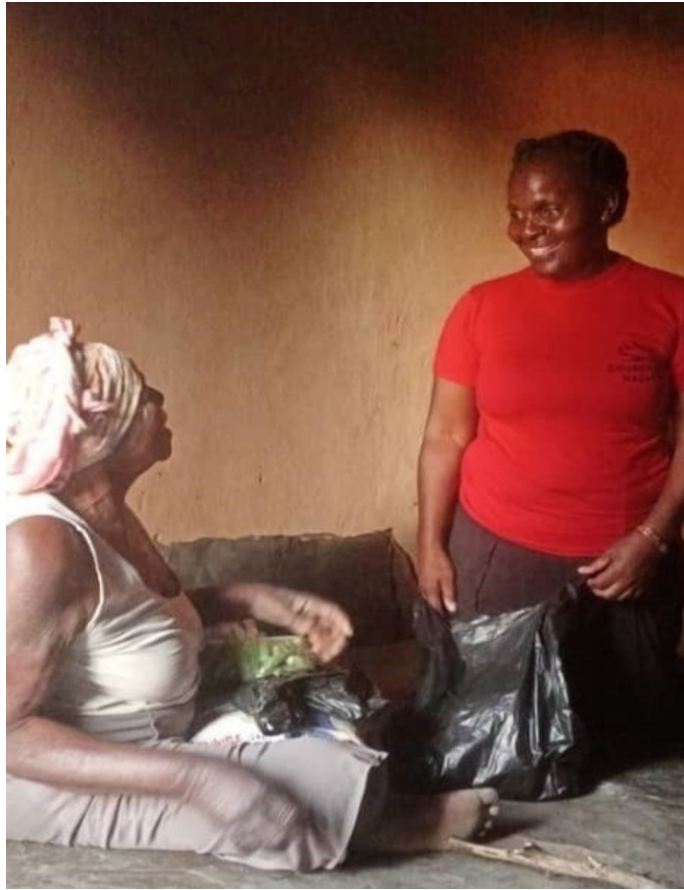
Zimbabwe East District NMI president giving groceries to an 86-year-old-woman.