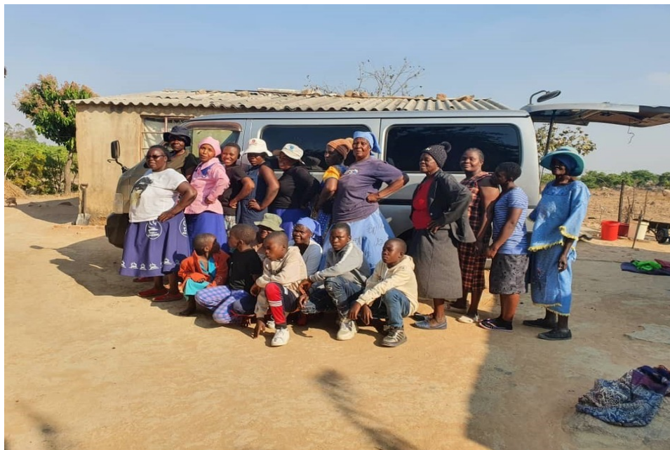
Midlands District reaching out.

Last month, one team went to the Buhera community in Manicaland province to cheer the elderly there. It was a powerful experience, showing the love of Jesus Christ to the elderly in tangible ways. In one case, NMI has adopted an elderly woman, buying her groceries every month. We hope to make a great impact on the lives of our youth, our children, and the elderly as we learn more effectively what it means to be intentionally intergenerational.