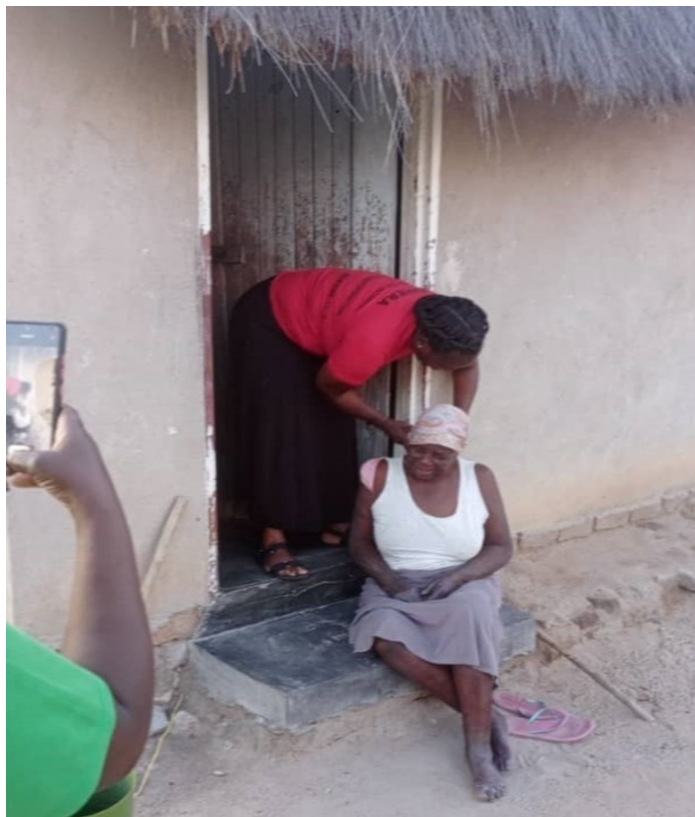
Cheering an elderly woman with simple acts of service.