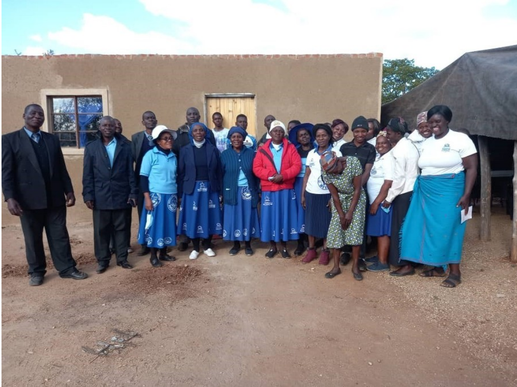
Zimbabwe West District team.