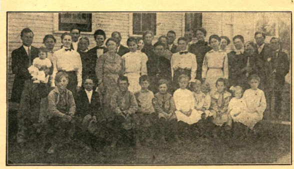
1913 The Faculty and Student-Body ······