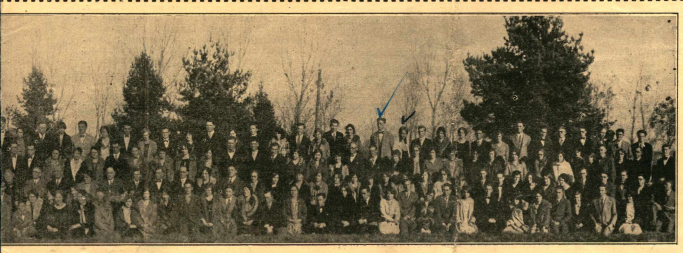
Northwest Nazarene College, First Semester 1928