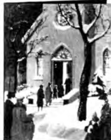
No. G 1016

Scripture: "For we have seen his star in the east, and are come to worship him" (Matthew 2:2).