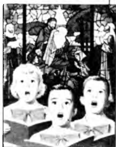
No. G 1013

Inexpensive —prices so pastor may remember all members and personal friends