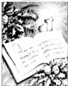
No. G 1015

ONLY $1.50 extra in each order of identical copy