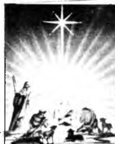
No. G 1014

Scripture: "And the Word was made flesh, and dwelt among us" (John 1:14).