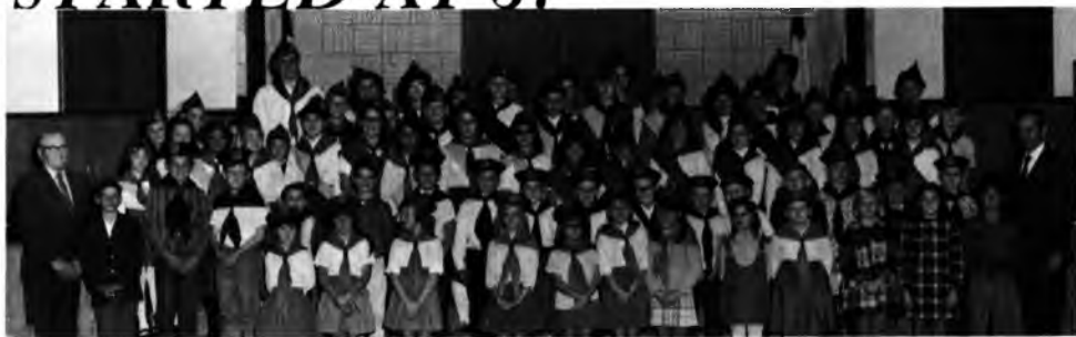
Muskogee, Okla., First Church