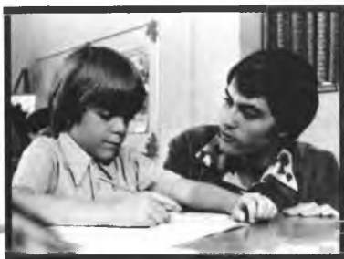
Interviews with teachers who really are ministering to their students

You will rejoice at the testimonies of how God is working during the Sunday school hour.