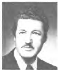
by Harold C. Frodge

Second, the commissioned evangelist is not only called but spiritually gifted. It is axiomatic that the divine call and spiritual gifts are inseparable. The church may mistakenly