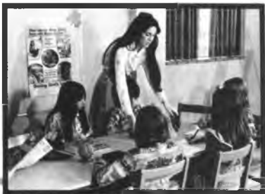
On-location shooting of actual teaching situations

Reveals the great potential and need for personal ministry through the Sunday school.