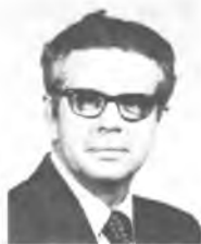
by Charles E. Baldwin

Today the lines between right and wrong are much diffused and out of focus. The holiness preacher, by a thorough grasp of truth, can project sharply focused lines of distinction.