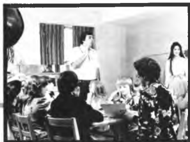
Firsthand accounts of those who have been helped

And He Gave ... TEACHERS highlights the special ministry of teaching. It is a film that will inspire and motivate people to teach more effectively. And it will help recruit new teachers.