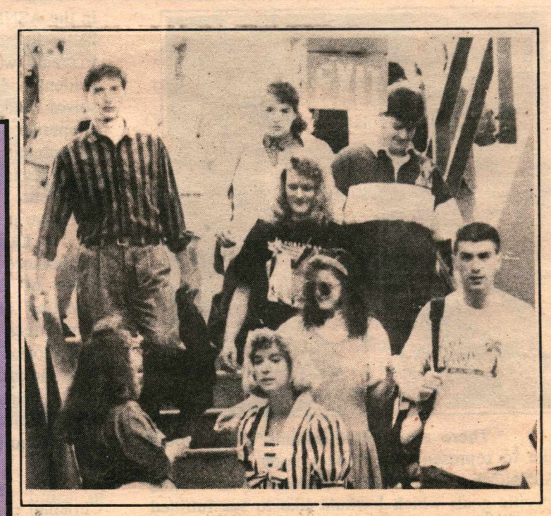
Students enter the gymnasium to hear speeches. The speeches given on Friday were for the ASNNC Secretary and ASNNC Executive Vice-President.

Voting on Monday will consist of the elected Executive Office candidates and the proposed ASNNC Term III Budget. Cast an intelligent vote and get involved in the leadership choice for next year.