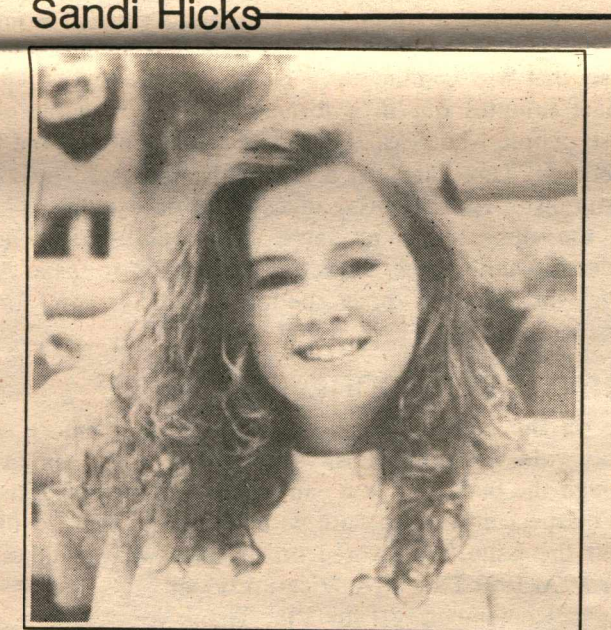
"I went to ENC and saw a lot of their activities that I wanted to see implemented here."